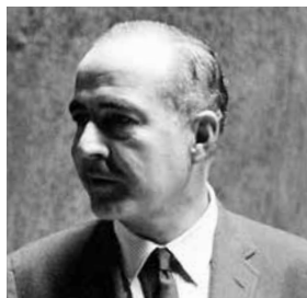
Samuel Barber Born in West Chester, Pennsylvania, March 9, 1910 Died in New York City, January 23, 1981

The most celebrated of American piano concertos arose from an auspicious confluence of forces. In 1959 Samuel Barber's publisher, G. Schirmer, commissioned him to write a piano concerto, the premiere of which would form part of the opening-week festivities of Philharmonic Hall (now David Geffen Hall) at the new Lincoln Center for the Performing Arts. It was Barber's first work in this genre, apart from an early student effort, and it presented him with a formidable challenge. He must surely have felt the pressure of the occasion—as America's foremost musical traditionalist, commissioned by the nation's leading music publisher to help inaugurate what would become the most important performing arts center in the hemisphere. Expectations would be high.