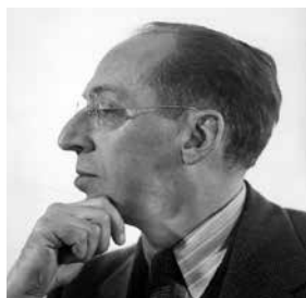
Aaron Copland Born in Brooklyn, November 14, 1900 Died in North Tarrytown, New York, December 2, 1990

Aaron Copland, born in 1900, lived a long and distinguished life not just as a composer, but also as a conductor, writer, concert organizer, and teacher. He was justly hailed as the “Dean of American Composers” and always seemed to be in the center of things, a generous colleague, and an inspiring model. His compositional style changed notably over the decades. At the age of 20 he went to Paris to study, and the music of Stravinsky became a major influence; next jazz emerged as another important influence. During his early 30s Copland went through a phase in which he wrote quite challenging Modernist pieces, angular and dissonant, even if never as extreme as those associated at the time with Arnold Schoenberg and his colleagues in Vienna.