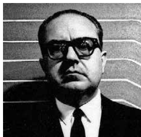
Alberto Ginastera Born in Buenos Aires, April 11, 1916 Died in Geneva, June 26, 1983