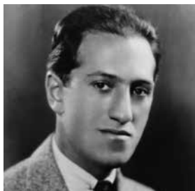
George Gershwin Born in Brooklyn, September 26, 1898 Died in Hollywood, July 11, 1937

The great American composer George Gershwin sought acceptance not only as a popular songwriter but also by writing serious concertos, ballets, and symphonic compositions. The Overture on today's concert reflects in miniature these dual concerns, as it contains all the dash of the Cuban rumba and all the contrapuntal intricacy of his highbrow studies.