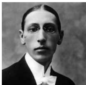
Igor Stravinsky Born in Lomonosov, Russia, June 17, 1882 Died in New York City, April 6, 1971

Music connected with dance has long held a special place in French culture, at least as far back as the age of Louis XIV, and there was an explosion of major full-length scores during the 19th century in Paris. Some of the perennial favorites were written by now generally forgotten figures, such as Adolphe Adam ( Giselle from 1841) and his pupil Léo Delibes ( Coppélia in 1870 and Sylvia in 1876). These composers inspired the supreme ballet music of the late century, that written by Tchaikovsky, the great Russian. With his Swan Lake (1875-76), Sleeping Beauty (1889), and Nutcracker (1892), ballet found its musical master.