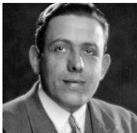
Francis Poulenc Born in Paris, January 7, 1899 Died there, January 30, 1963

The period between the world wars was a heady time for Parisians. Jazz was in the air. The city was “the place to be” for painters, musicians, dancers, and authors. Igor Stravinsky had mellowed somewhat since his shocking early ballets ( Petrushka , The Rite of Spring ) and was writing vaguely abstract recreations of remote times and places. Meanwhile a group of composers whom music critics called “Les Six” (the Six) was itself becoming more audience-oriented, as we might say today, denouncing the abstruseness of the prevailing post-Wagnerism in a loosely defined movement that at times touched upon nationalism. And they embraced jazz unashamedly.