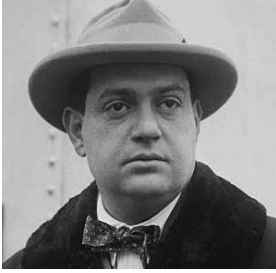
Darius Milhaud Born in Aix-en-Provence, September 4, 1892 Died in Geneva, June 22, 1974

If Darius Milhaud had not written so bewilderingly much—he reached Op. 443 in his catalogue—more of his music might be remembered. The Creation of the World , though, would be a stand-out piece for anyone: a portrait of early jazz in which this new, alternative kind of music brings not brashness but a rich and strange potency.