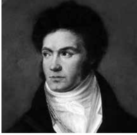
Ludwig van Beethoven

Most of the familiar titles attached to Beethoven's works were first applied by someone other than the composer. Critics, friends, and publishers invented the labels “Moonlight,” “Tempest,” and “Appassionata” for popular piano sonatas. Prominent patrons' names—Archduke Rudolph, Count Razumovsky, Count Waldstein—became wedded to compositions they either commissioned or that were dedicated to them, thereby winning a sort of immortality for those who supported the composer.