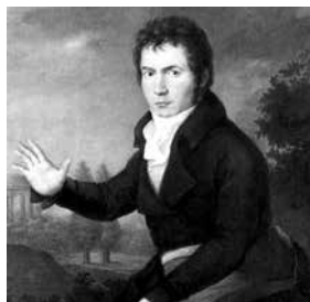
Ludwig van Beethoven Born in Bonn, probably December 16, 1770 Died in Vienna, March 26, 1827

Beethoven's Fifth did not immediately become the world's (or even the composer's) most famous symphony. During his lifetime the Third, the mighty "Eroica," was performed more often and the second movement of the Seventh (movements were often heard separately) deemed "the crown of instrumental music." But over the course of the 19th century the Fifth gradually came to epitomize both Beethoven's life and musical style. It often appeared on the inaugural concerts of new orchestras, such as when The Philadelphia Orchestra first performed in November 1900. The Fifth Symphony picked up further associations in the 20th century, be they of Allied victory during the Second World War or through its frequent appearances in popular culture.