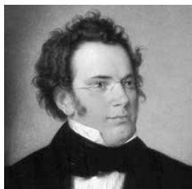
Franz Schubert Born in Vienna, January 31, 1797 Died there, November 19, 1828

The popular image of Schubert as a shy, neglected genius who tossed off immortal songs on the backs of menus is finally beginning to crumble. Given the rather limited professional opportunities available to a young composer in Vienna during the 1820s, Schubert’s career flourished and was clearly heading to new heights when he died at age 31, just 20 months after Beethoven. The first of the great Viennese composers actually born in the city, Schubert enjoyed the best musical education available, was a member of the Vienna Boys’ Choir, studied with Antonio Salieri, and gradually found his music being championed by leading performers of the time.