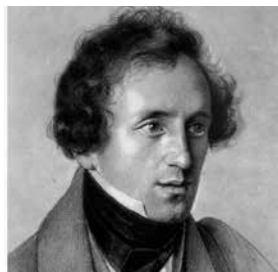
Felix Mendelssohn Born in Hamburg, February 3, 1809 Died in Leipzig, November 4, 1847

The 20-year-old Mendelssohn was a fully formed artist when he embarked on what he called his “Grand Tour” of Europe in 1829. In addition to being a virtuoso piano prodigy, the precocious youth had composed operas, symphonies, and concertos, chamber and piano music, and his miraculous overtures to A Midsummer Night’s Dream and Calm Sea and Prosperous Voyage .